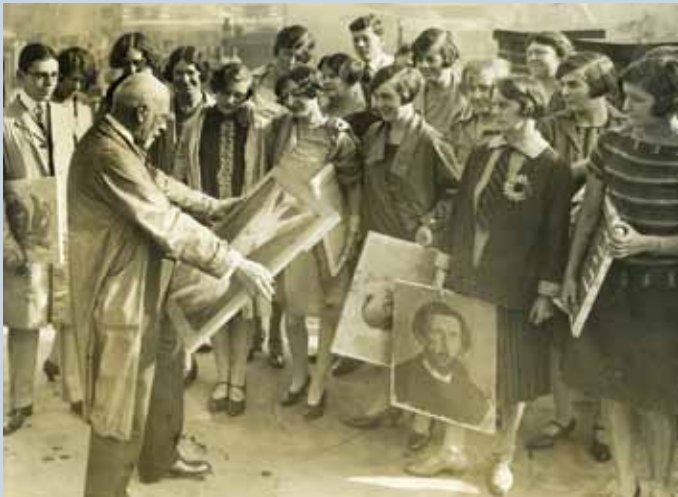
Heatherley's was the first art school to admit women on equal terms