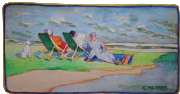
Gertrude Massey - A Windy Day