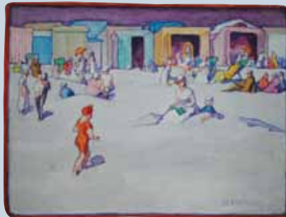
Gertrude Massey - Bucket & Spade and Beach Huts